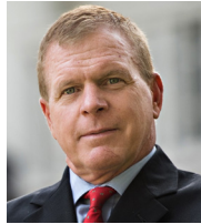
Tom C. Feeny Chief Executive Officer

Led by former Speaker of the Florida House and former Congressman Tom Feeny, along with the most talented lobby team in Florida, AIF can help your company achieve a greater level of success in the State Capitol.